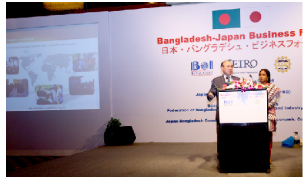
Prime Minister Abe introduced Ms.Nilufa in his speech at 68th UN General Assembly.

We usually use sand and gravel for filtration, but this time, let's use my handkerchief. See? It's very clean and clear water, isn't it? It's also safe and tasty. Now let me drink it. Yes, it's delicious. The main component of the water purification agent is the sticky substance in nature which is the same with that of Japanese traditional food "Natto". I believe you understand it soon by seeing the demonstration, but only if there are tanks, anyone can make the water purification equipment to purify big amount of water.