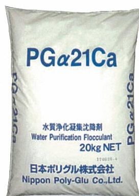
PG \alpha 21Ca (20kg)

※ MSDS (Material safety data sheet ) is provided separately.